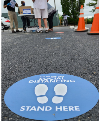
Martinsville Southern Connector Study Public Hearing on the Draft EIS was held on Tuesday, September 1, 2020.

VDOT held a public hearing on the Draft Environmental Impact Statement (EIS) on Tuesday, September 1, 2020, at Jack Dalton Park. VDOT held the public hearing outdoors under a picnic shelter with social distancing guidelines in place. More than 50 citizens attended during the course of the four-hour public hearing.