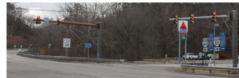
Route 311 and Route 419 intersection in Roanoke County at Hanging Rock